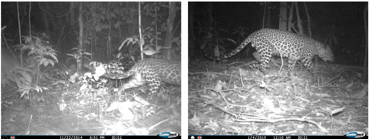
Fig. 3. Trap photos of one possible female (left) and one male (right) spotted leopard.

The spotted leopard is rare in Peninsular Malaysia – so far it has been reported only in two other written works: one in Endau Rompin National Park, in the southern state of Johor [8]; and the other mentioned anecdotally (in an old identification book) as being outnumbered by 'conventionally colored leopards' in Malaya [9]. This is despite the extensive camera trapping efforts in Peninsular Malaysia, all of which (with the exception of the above two studies) have recorded the presence of only the melanistic form [6, 10-15]. A study in 2010 examined the frequency of leopard melanism in 22 locations in Peninsular Malaysia and southern Thailand [5] (Fig. 2). Out of 42,565 trap-nights, 445 photos of melanistic leopards and 29 photos of the spotted morph were collected; all photos of the spotted leopard were taken from study areas north of the Isthmus of Kra, which is the narrow neck of southern Myanmar and Thailand and a well-known zoogeographical boundary [16]. We also added data from five studies since 2010 on figure 1. All these suggest that spotted leopards are at the very least rare in Peninsular Malaysia.